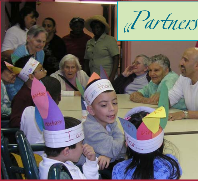
Children from PS 124 brought dessert and entertainment to PSGDC's Thanksgiving celebration.